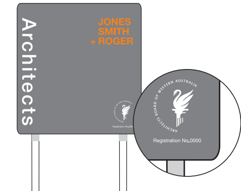
SAMPLE SITE SIGN